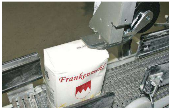
Marking of flour bags