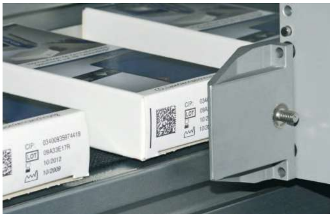
Cardboard box coding using DataMatrix code