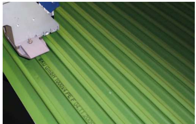
Coding of plastic profile plates

WILUX PRINT AG Unterfeldstrasse 5 CH-8340 Hinwil